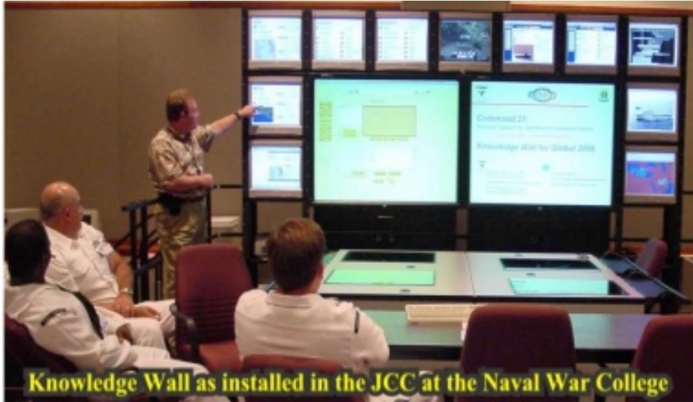
Knowledge Wall as installed in the JCC at the Naval War College

The Global 2000 “Knowledge Wall” is the first iteration of a concept developed as part of the Office of Naval Research sponsored Command 21: Decision Support for Operational Command Centers applied research program. The wall was developed at the request of COMTHIRDFLT and COMCARGRU ONE for use during the Global 2000 wargame to explore the implications of Network-Centric Warfare to C4I. The wall is designed given the COTS hardware and software capabilities that exist today so as to minimize development costs, and therefore differs from the original Command 21 Knowledge Wall vision.